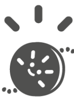
Project 116 & 204

Salary funding for a leadership position with protected clinical research time to develop new molecular diagnostic tools and build expertise and research capacity. The key outcome will be evidence of the changes that occur in the genes of cancer cells, and how those changes can be used in cancer diagnosis and the selection of appropriate treatments.