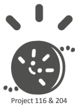
Project 116 & 204

Salary funding for a leadership position with protected clinical research time to develop new molecular diagnostic tools and build expertise and research capacity. The key outcome will be evidence of the changes that occur in the genes of cancer cells, and how those changes can be used in cancer diagnosis and the selection of appropriate treatments.