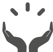
Projects 133 & 218

Australia's first paediatric living organoid and functional genomic program utilising individual patient's tumour cells to identify new therapeutic targets and repurpose existing targets. Research into brain cancer, central nervous system tumours and Wilm's tumour will lay the foundation for establishing a systematic pipeline to test and identify personalised cancer therapeutics for paediatric cancer patients with the greatest unmet clinical need. The key outcome will be proof of concept functional diagnostic screens based on each cancer's unique genetic profile using paediatric organoid models. Successful completion of this pilot phase will lead to integration of comprehensive molecular analysis into clinical management by guiding molecular-targeted therapeutics for cancer patients.